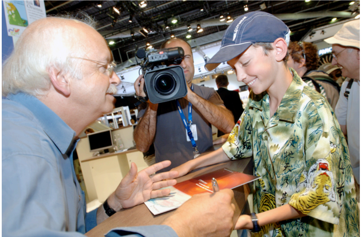
Erik Orsenna and a young admirer at the Airbus Pavillion for book signings of the Isle of Flight.